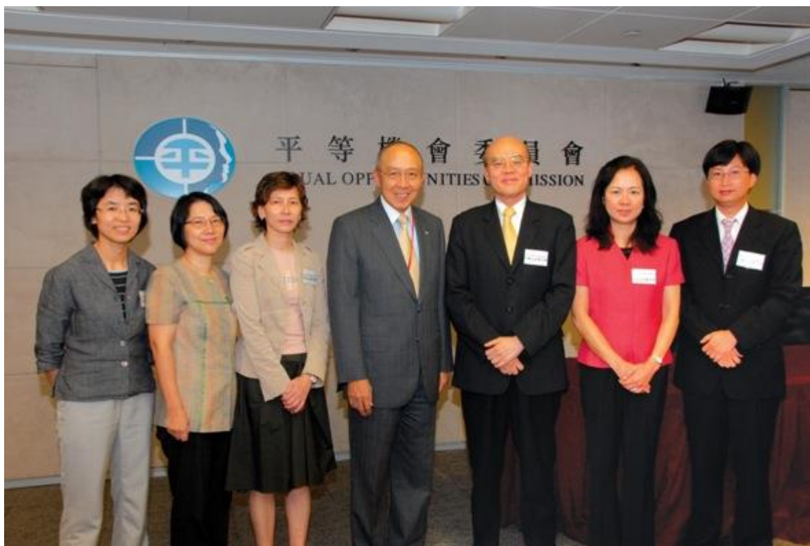
Experts share their knowledge and vision at the Information Session on AD/HD and SLD.

What are Attention Deficit / Hyperactivity Disorder (AD/HD) and Specific Learning Disabilities (SLD)? These terms have puzzled many parents and educators. In an attempt to provide answers and solutions, the Equal Opportunities Commission (EOC) invited leading experts in the field to explain these conditions and introduce the support network available in Hong Kong at an information session for educators, social workers, parents and EO Club members on 8 October 2007.