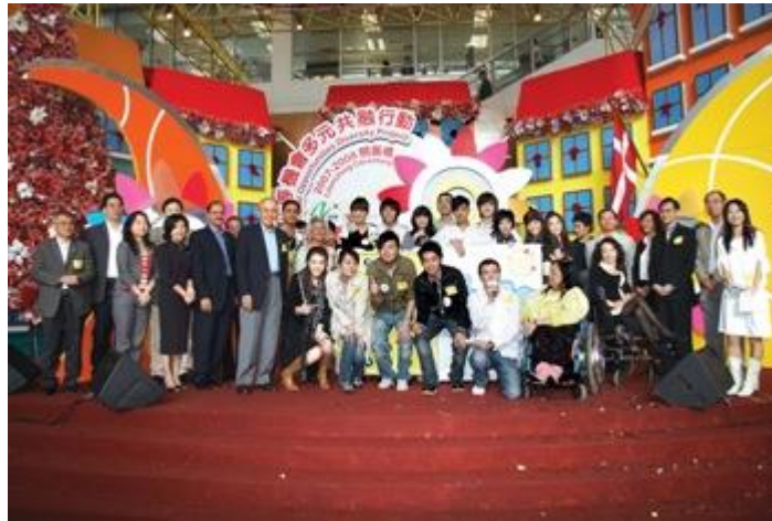
Kick-off ceremony of the Equal Opportunities Diversity Project” cum book launch of the EOC 10th Anniversary Commemorative Publication - Advancing Equal Opportunities”