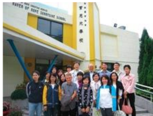
EOC staff and their family members visited students with disabilities of the Haven of Hope Sunnyside School. We also participated as volunteers in Haven of Hope’s Charity Cookies Sale. Money raised was used for elderly services.